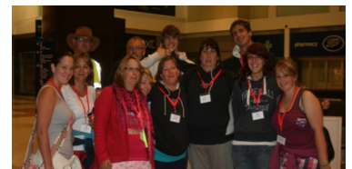
An excited group including members of the First XV, Colts, & Ladies before they set off for the midnight walk along the Sandbanks peninsula..

Over the summer this has included taking part in the Plane Pull for Motor Neuron Disease, the Lunar Walk for the friends of Forest Holme, a midnight half marathon for “Shine for Cancer”.